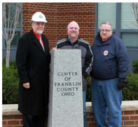
We invite you to explore our history as told through monuments and statues placed throughout Franklin County.