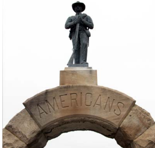
Two of the eleven monuments highlighted in the 2015 Franklin County Road Map